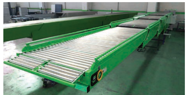
Gravity Roller Telescopic Conveyor