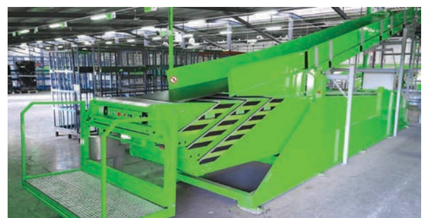
Handling Platform for loading and Unloading stand