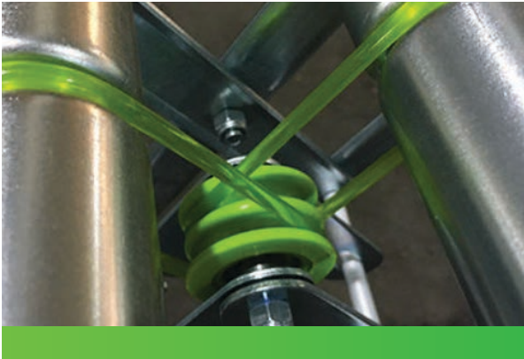
PU O Ring