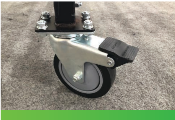
5 inch dia plate type castor wheel