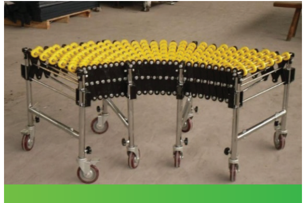
Skate Wheel Type